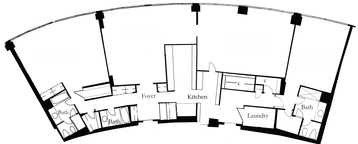
FLOOR PLAN IS APPROXIMATE