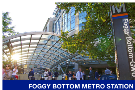
FOGGY BOTTOM METRO STATION