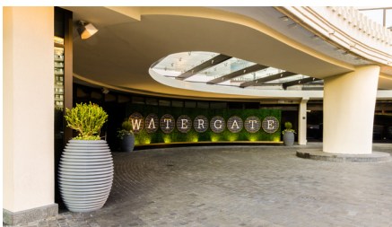
THE WATERGATE HOTEL