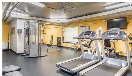
WATERGATE WEST FITNESS ROOM