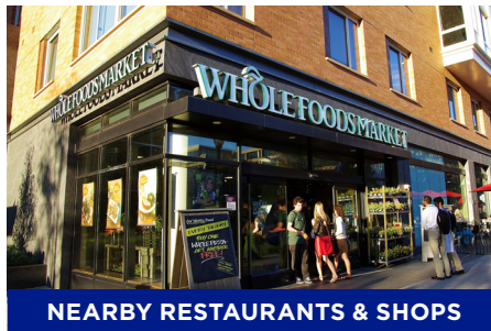
NEARBY RESTAURANTS & SHOPS