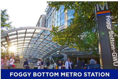
FOGGY BOTTOM METRO STATION