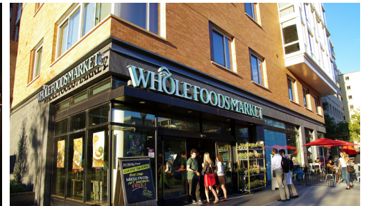
NEARBY RESTAURANTS & SHOPS