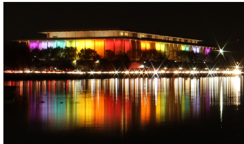
THE KENNEDY CENTER