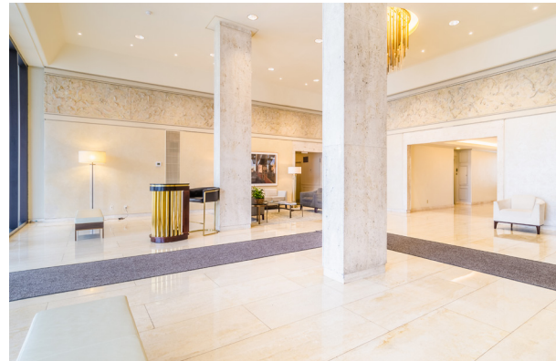
WATERGATE WEST AMENITIES