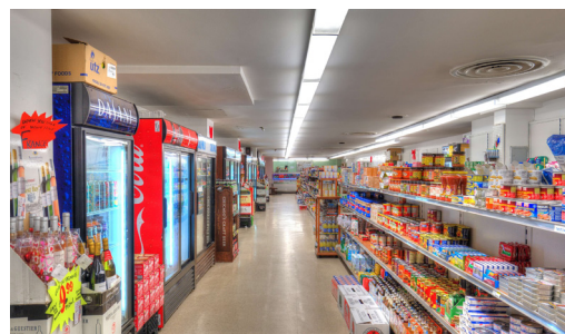
THE TOWERS MARKET