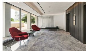
WATERGATE EAST LOBBY