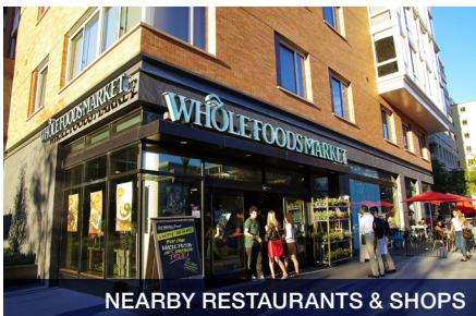
NEARBY RESTAURANTS & SHOPS