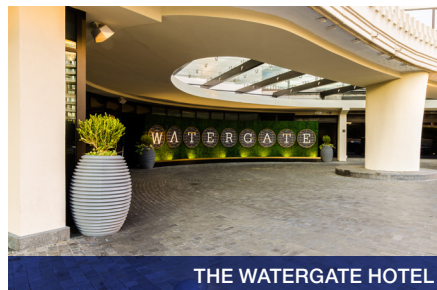
THE WATERGATE HOTEL