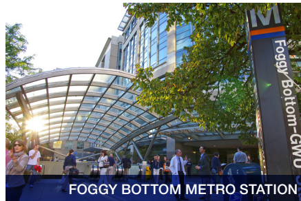
FOGGY BOTTOM METRO STATION