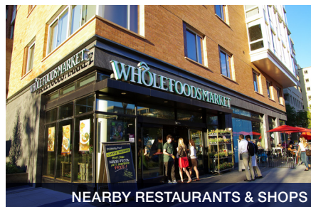
NEARBY RESTAURANTS & SHOPS