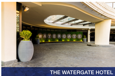
THE WATERGATE HOTEL