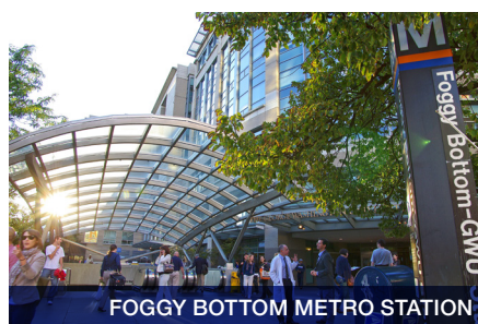
FOGGY BOTTOM METRO STATION