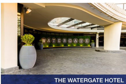
THE WATERGATE HOTEL