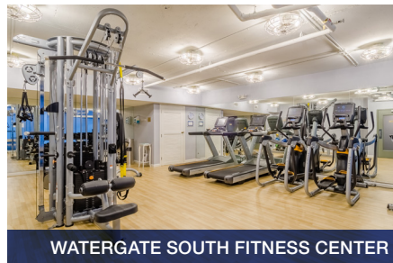
WATERGATE SOUTH FITNESS CENTER