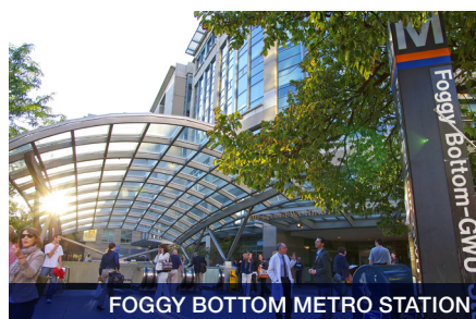
FOGGY BOTTOM METRO STATION